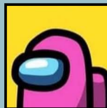
Vacant Commissioner of Publicity